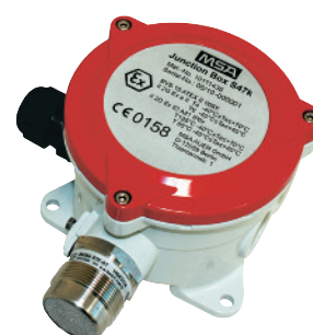
47K M25 x 1.5