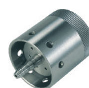
Weather protection cap