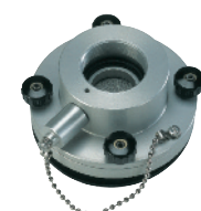
Duct mount flange