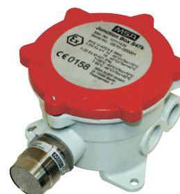
47K 3/4" NPT

Additional accessories are available for environmental protection and a remote/in-situ calibration kit for ease of maintenance.