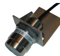
HT sensor and wall mount bracket